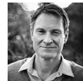
Claus Meyer, gastronomic entrepreneur and mindset challenger